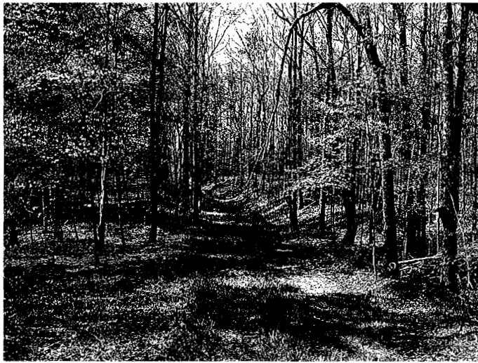
Permanent firelanes also serve as roads.

Most vegetation on permanent firelanes requires annual fertilization. The same rates that were applied initially should be used. A good time to fertilize is when the annual grass is planted in late summer.