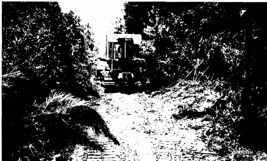
A 12- to 15-foot path is pushed with the straight blade of a tractor.

by MADELINE HILDRETH, Alabama Forestry Commission, Brewton