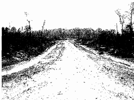
BMPs are not voluntary on wetland roads and stream crossings

Minor drainage refers to installation of ditching or other water control facilities for temporary dewatering of an area. Minor drainage is considered a normal silvicultural activity in wetlands to temporarily lower the water level and minimize adverse impacts on a wetland site during road construction, timber harvesting and reforestation activities. Minor drainage does not include construction of a canal, dike or any other structure which drains or significantly modifies a wetland or other aquatic area.