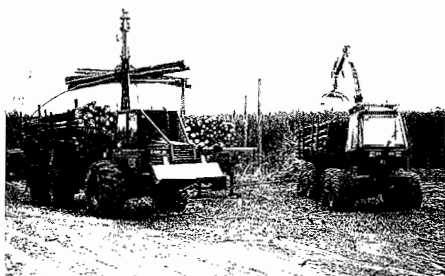
Forwarders have much potential to minimize some environmental concerns.

Cut-to-length systems probably will not run tree-length systems out of the woods in the near future, but as landowners and the public demand alternative logging approaches, innovative loggers will answer this need with cut-to-length systems.