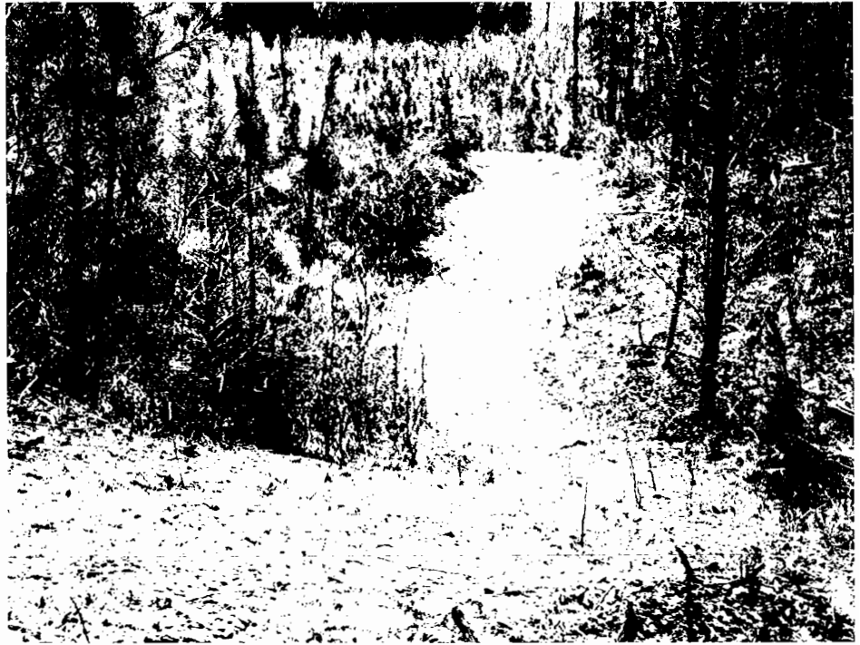
Pine plantation and firebreak/access road that has been sown with a wildlife food crop.

One of the most impressive features of the forest is the roughly two miles of shore line along the Tallapoosa River. The river is still free-flowing in this area and has stretches of white water and deep holes where the fishing is good. Sonny has several food plots on his forest and is in the process of seeding the firebreaks—secondary roads—to prevent erosion and to