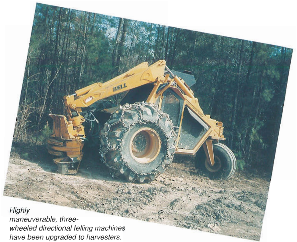
Highly maneuverable, three-wheeled directional felling machines have been upgraded to harvesters.

If you are not directly in the timber harvesting business or do not sell timber on a regular basis, you may not be aware of the continuing trend toward mechanized logging in Alabama. In this article we will look at how changes in the business of forestry have prompted moves toward mechanization, some of the newly introduced technologies, and the implications of mechanization to forestland management on private, non-industrial lands.