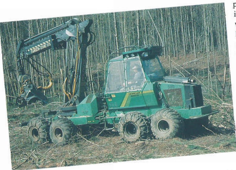
Cut-to-length harvesters use state-of-the-art electronics and hydraulics.

As Alabama's population continues to urbanize, fewer individuals are willing to work long days in wide-ranging climatic conditions, with insect pests, and under constant stress to produce at the lowest possible cost. The survivors are tougher and more professional than ever.