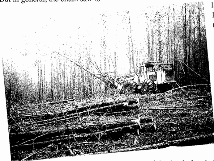
Feller-bunchers increase wood production in an efficient manner.

Chain saws are still used for felling and processing in some of the more difficult terrain, particularly the steeper ground. But in general, the chain saw is