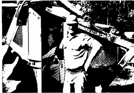
Maplesville's Gene Carter is a good example of today's professional timber harvester.

flotation tracks for soft soils or extra traction for steep terrain. The concept of carrying trees vertically has allowed trees to be bunched in efficient, properly sized packages for transport to a log loading site.