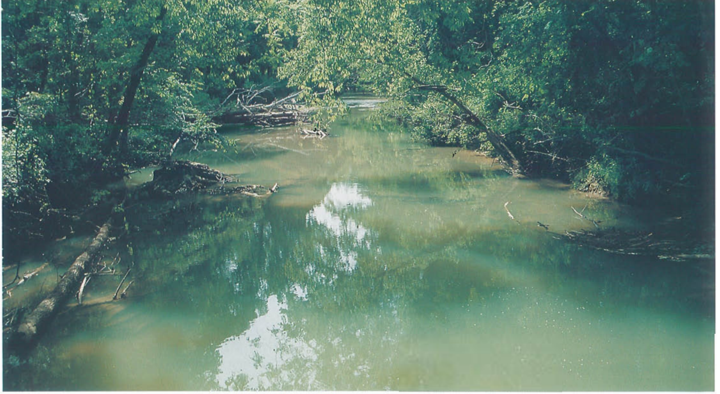
Rock Creek flows through the property.