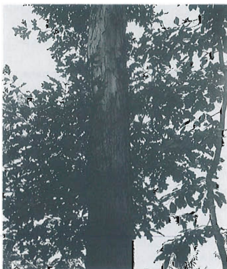
Epicormic branching on white oak.

Grade 1 logs are of the highest quality. They tend to yield a considerable amount of lumber that is clear (free from visual defects), sound (free from structural weaknesses), and individual pieces are relatively large in size (length and width). Grade 3 logs occupy the other end of the spectrum and tend to yield a low amount of lumber that is clear and sound, and individual pieces are relatively small. Grade 2