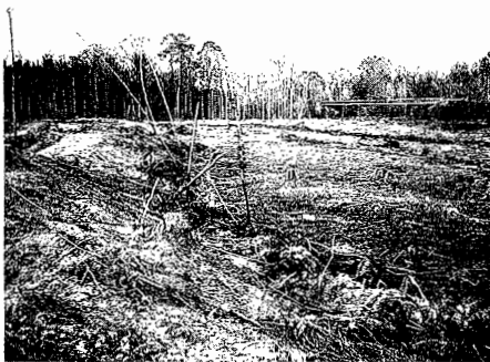
EPA wetland regulations currently allow mechanical site preparation and conversion of bottomland hardwoods to pine plantations.

Beaver impoundments and other blockages. Removing surface water that