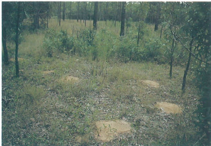
Pocket gopher mounds resemble anthills.

We still don't know enough about the current distribution and status of the remaining populations of pocket gophers in Alabama, but the documented decline of the species has warranted its classification as a Species of Special Concern, and it receives formal protection by a Game and Fish regulation. Their burrowing lifestyle hampers their ability to disperse overland, and fragmentation of their habitat by hard-packed roadbeds may be a barrier to animals that would ordinarily colonize otherwise suitable areas. This, combined with a low reproductive rate, makes the pocket gopher prone to extinction in today's man-dominated landscape. The southeastern pocket gopher is the only subspecies of Geomys pinetis in Alabama, but three Georgia subspecies are believed to have become extinct in recent times. With the increasing rate of loss of natural areas, responsible stewardship and management of remaining occupied habitat on both public and private lands will be required if our children and grandchildren will have the opportunity to wonder at those curious piles of sand and learn of the fascinating sandy-mounder. ♣