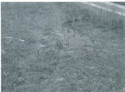
Streamside management zones should be established and managed around all major drainages.