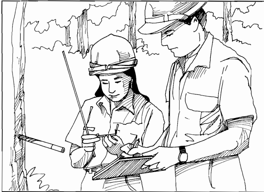
An increment borer is used to take a core sample from a tree at 4 1/2 feet above the ground. A tree's age and growth rate can be determined by examining the rings of the core sample.

It is a good idea to check seedling survival in the fall following the first growing season. A 1/100th acre plot tape can help you sample seedling survival. The plot tape is swung around in a full 360 degree circle from a fixed point, and all seedlings inside this circle are counted.