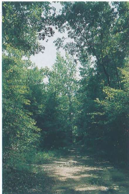
Hardwoods line many of the roads.

Three quarters of the property is in hardwood or a pine-hardwood mixture. McCollum bought the original 400 acres while he was serving his residency in Birmingham, and has gradually added surrounding tracts to the property from neighbors who wanted to sell or trade. Each of these tracts is named after its former owner. Some of what McCollum acquired was once pastureland, and these areas have been transformed into wildlife