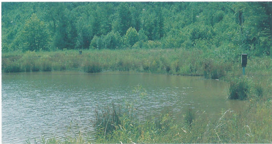
One of the duck ponds. In the background, hardwoods are naturally regenerating.

The Conservation Reserve and Forestry Incentives Programs have been utilized to help plant some of the pastureland in pine trees. Three out of the last four years McCollum has planted containerized pine